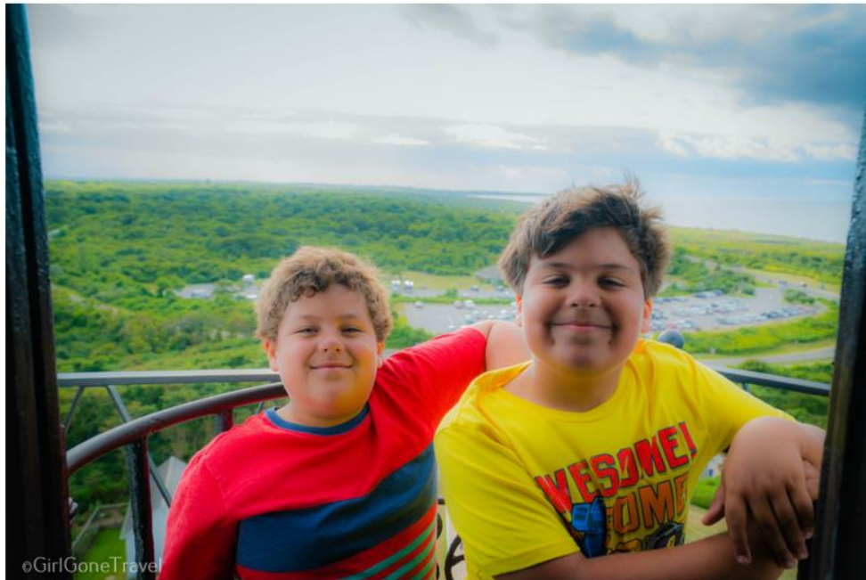
At the top of the Montauk Lighthouse Tower.

We learned about the fascinating history of area during a visit to Montauk Point Lighthouse Museum and climbed up the 137 steps up the tower of this National Historic Landmark – built in 1796, making it the first lighthouse in New York State.