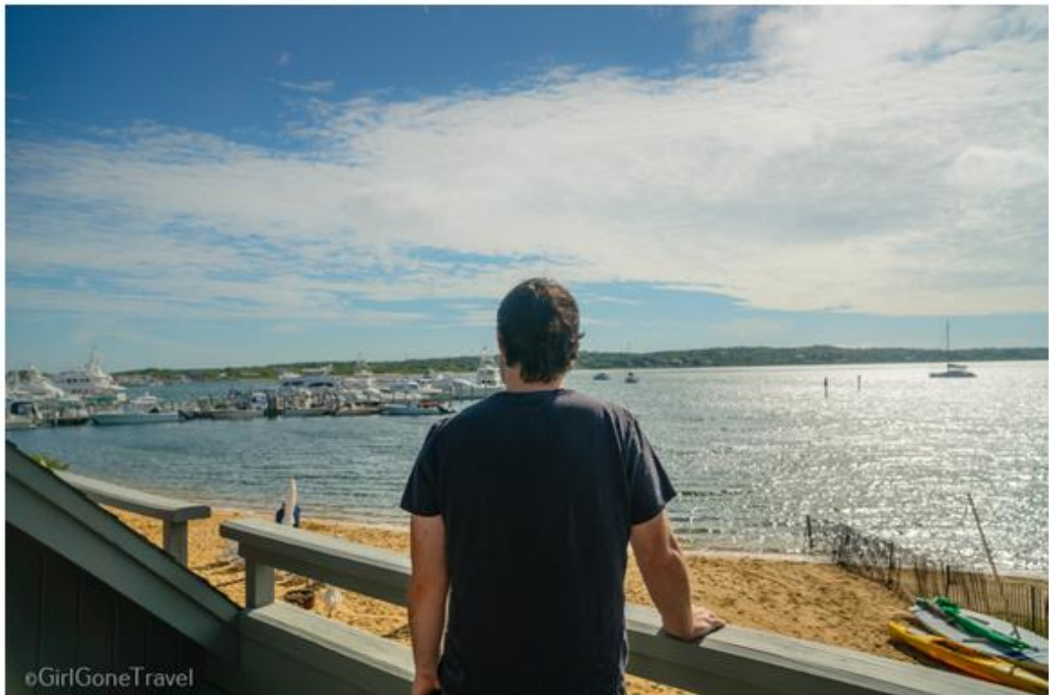
The hotel has been an East End favorite for over 80 years, with its iconic lighthouse serving as its beloved symbol.